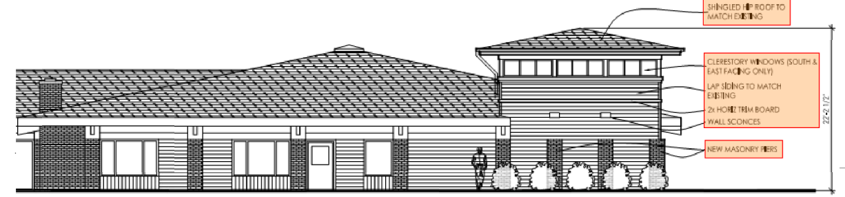
PROPOSED SOUTH ELEVATION "A"

Exist: 3,150 sf New: 4,300 sf 35% Increase